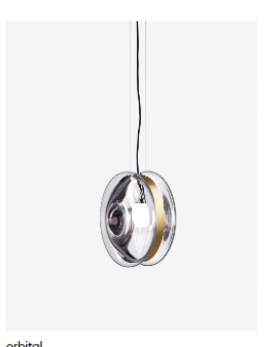
orbital pendant moon clear / patina brass