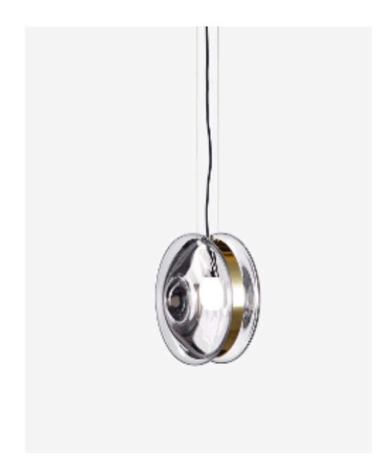
orbital pendant moon clear / polished brass