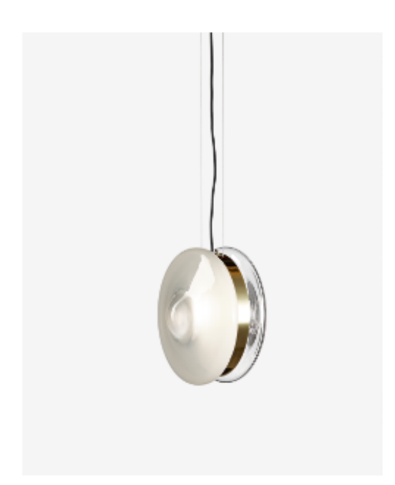
orbital pendant polaris white / polished brass