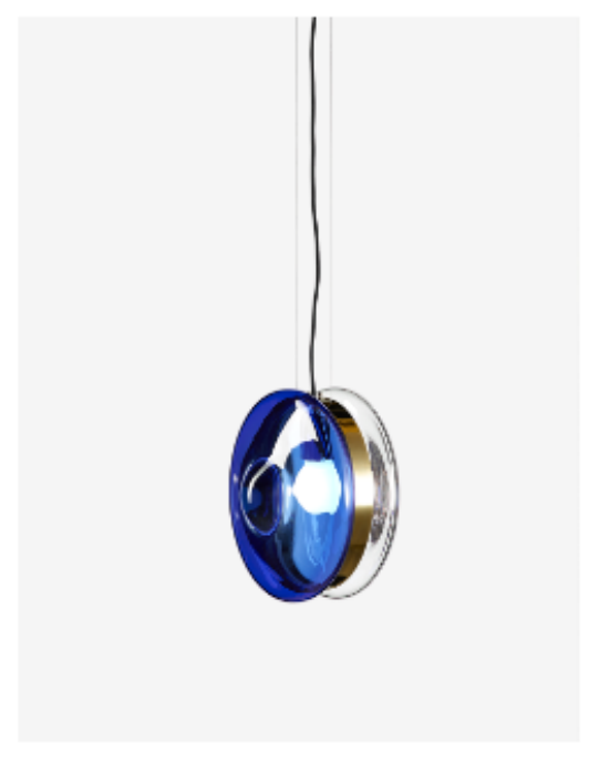
orbital pendant neptune blue / polished brass