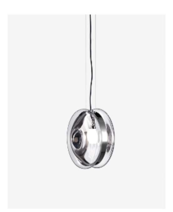
orbital pendant moon clear / nickel