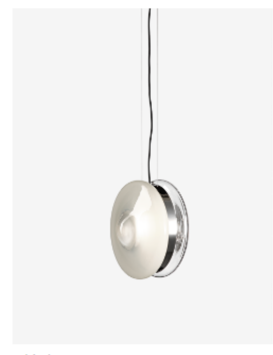
orbital pendant polaris white / nickel