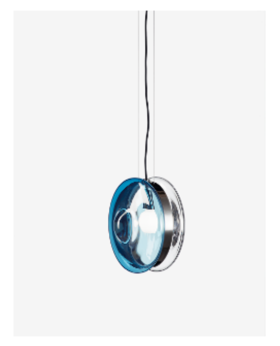
orbital pendant pluto green / nickel