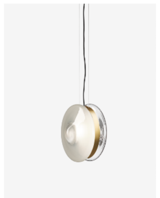
orbital pendant polaris white / patina brass