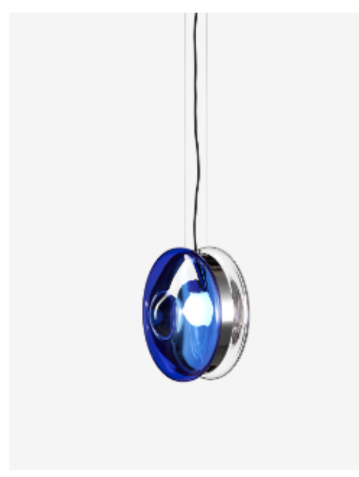
orbital pendant neptune blue / nickel