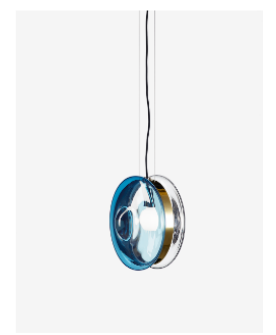
orbital pendant pluto green / polished brass